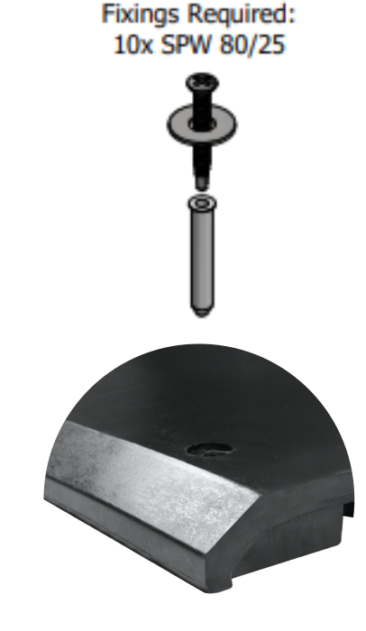
Sloped non-abrasive profile at the rear